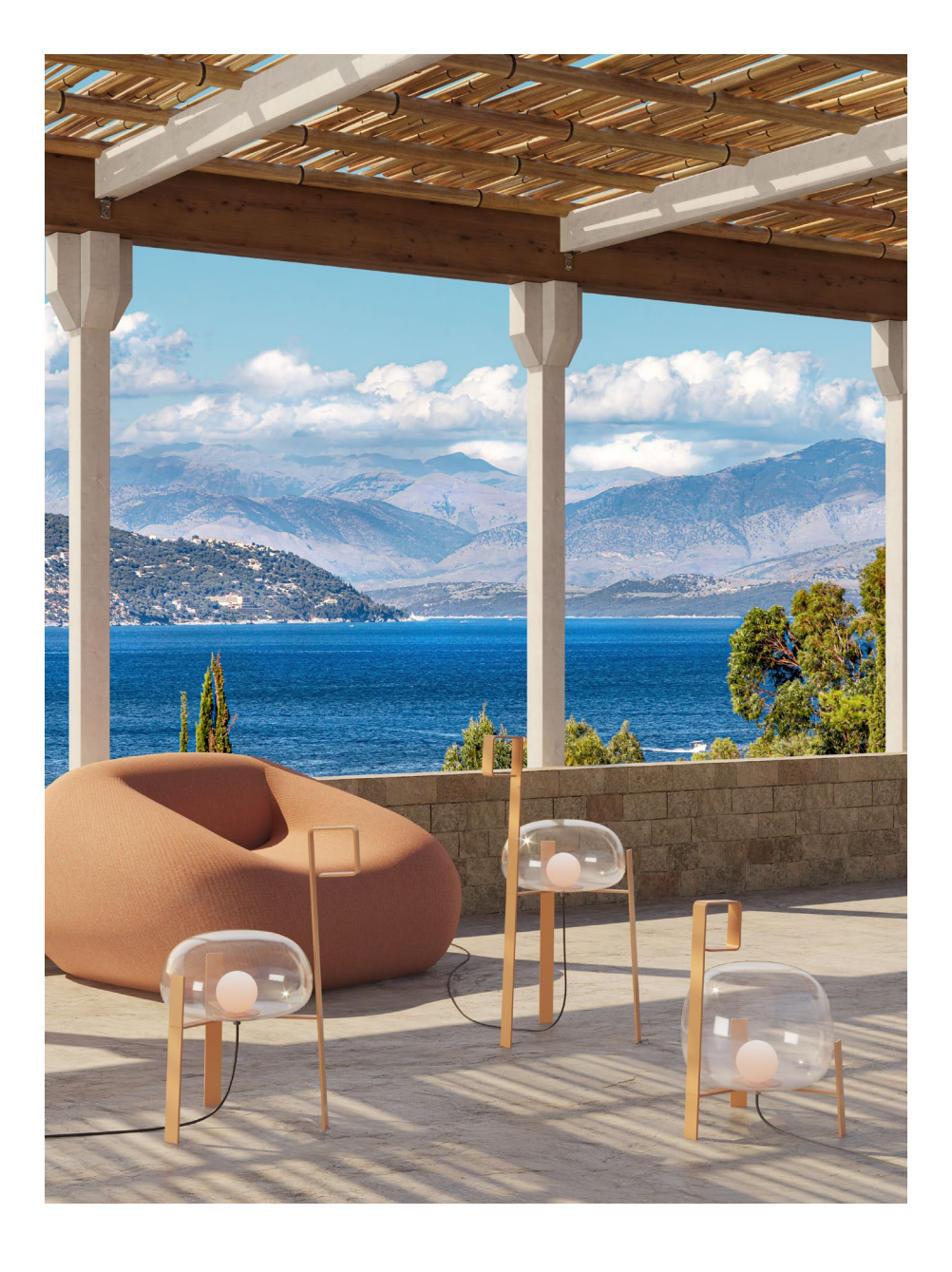
Combination of colors, inspired by the earth as this Ourika color, name of red valley in south Marrakech.